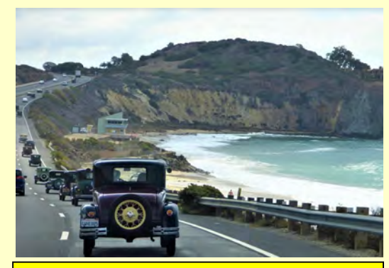
Does anything say "So. Calif." better than sunnyblue skies, palm trees, beautiful ocean waves and fine looking cars ???!.... Just doesn't get any better!!